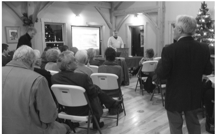
Photographs from the CCFT annual Meeting at Happy Valley Winery in State College, PA.